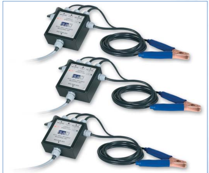
BSG-1000 Remote Heads