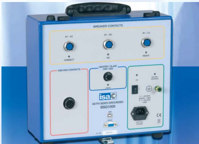
BSG-1000 Main Unit

While testing a Circuit Breaker in high voltage substations the situation may become dangerous due to the high electric potential. This can be caused by a capacitive coupling from a close conductor, when a lightning