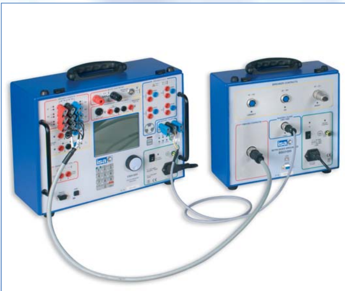
CBA1000 connected to BSG-1000